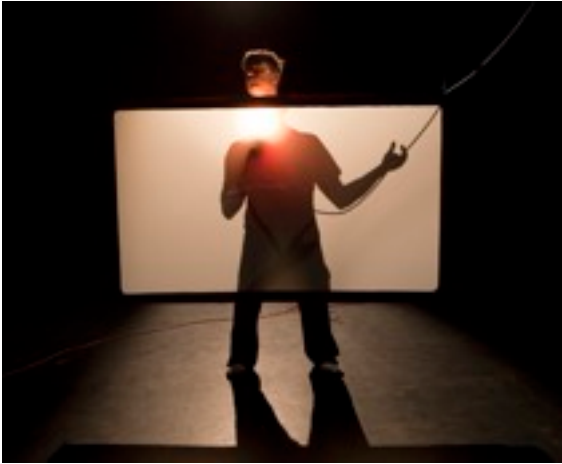
Nopeussokeus by Kalle Hakkarainen